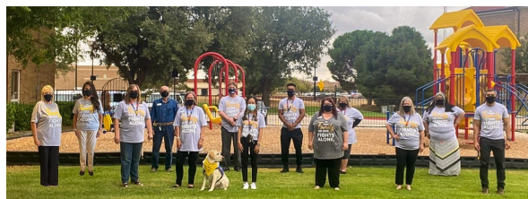
RMHC of the Southwest Staff