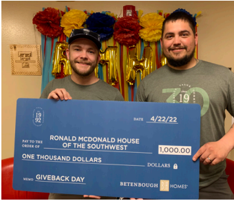
Betenbough Homes celebrating their 30th anniversary by donating to RMHC and bringing lunch for families and staff.

Volunteers & Donors are Heroes to RMHC Families!