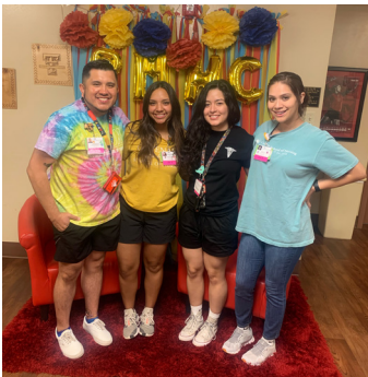
Covenant School of Nursing students have been volunteering their time as Guest Chefs.