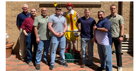
Local National Guard members take a break from serving our country to serve a meal for families.