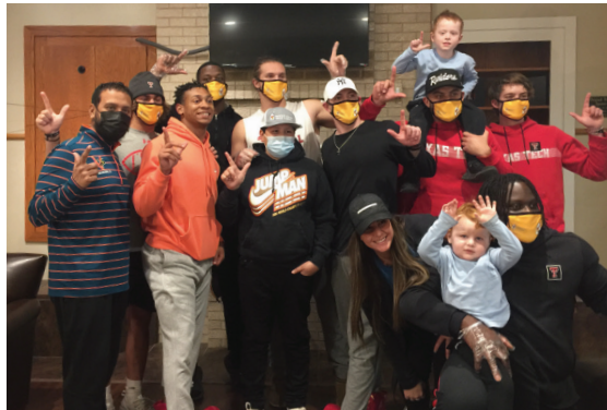
Texas Tech Football Players bring joy to the families staying in the House.