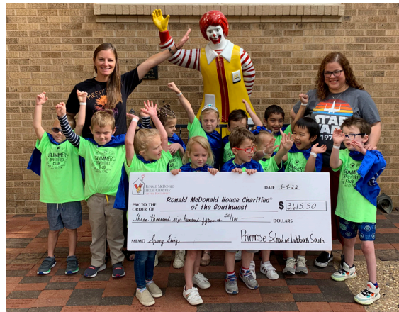
Primrose School proves you are never too young to be a hero and raise money for RMHC of the Southwest.