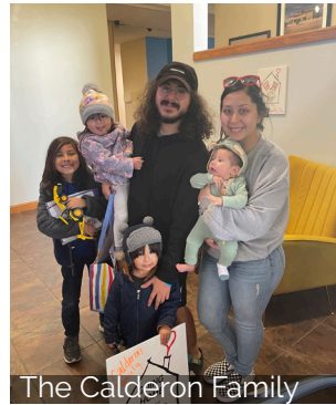
The Calderon Family