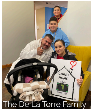
The De La Torre Family