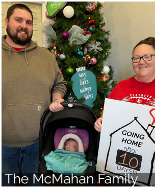
The McMahan Family